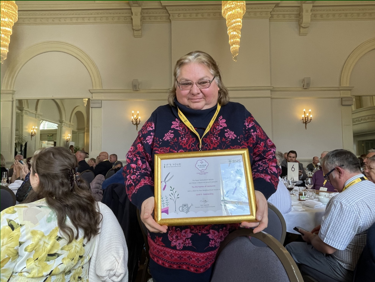
Another Wales in Bloom Gold Award

Produced for the Old Hamlet of Llanmartin Residents Association