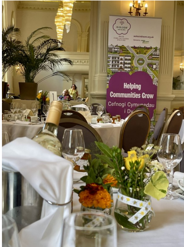
The Angel Hotel

Back at the Angel Hotel the brass band played to welcome guests and there was a welcome drink of Prosecco. Only two guests were allowed from each entry but the venue was bursting at the seams as guests took their seats. There was a considerable overflow in an adjoining room as well!