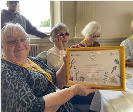
It's Our Neighbourhood Award

There was Abergavenny honey for each guest and wine on the tables from the Sugarloaf Vineyard. A delicious lunch followed and then on to the main event - the awards in the form of certificates and a few converted plaques and one special silver cup. There were many happy faces as entrants learnt how they had done. There was a very large contingency in the neighbourhood awards and we received outstanding recognition- the top tier of awards.