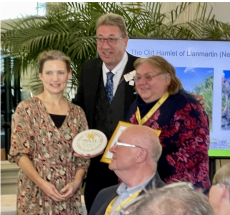
Presentation of Gold Award and Best Village

Next was the highlight for us - the announcement of the gold award in the small village category, along with the best village plaque, which truly felt like our crowning achievement.