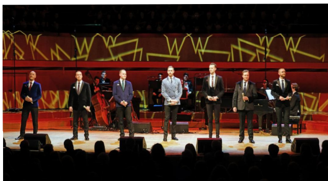
Only Men Aloud. A Brit award winning group who have now been performing for over 20 years and delighting audiences worldwide