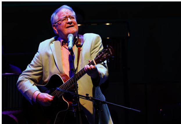
Dafydd Iwan- a singer song writer who lives near Caernarfon. His song, 'Yma o Hyd' being the Welsh football teams official song in the World Cup in Qatar