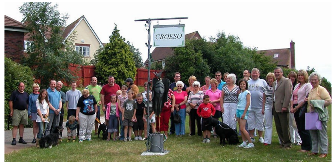
The Hamlet gathers for its unveiling