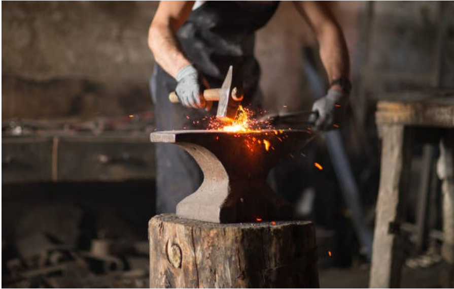
After months of searching for a suitable workshop Mike is pleased to announce that Simon at Pencoed castle is providing a barn space for his workshop/forge.