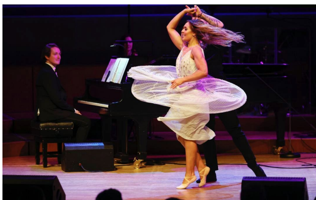
Amy Dowden and partner performing a dance from Strictly come Dancing