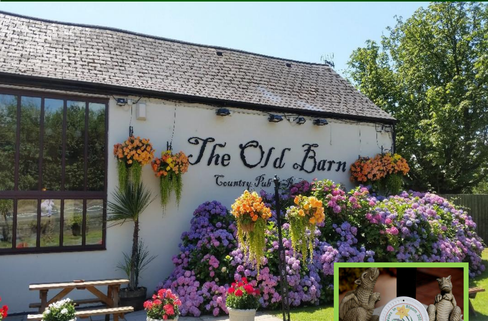
Village Pub and Restaurant