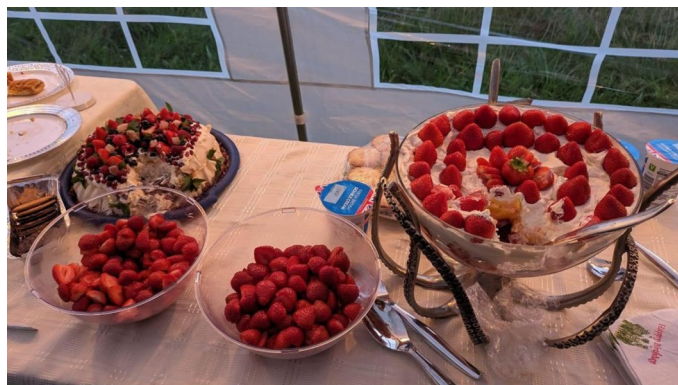
Plenty of great food

For a weekly snapshot of your local city councillors activity